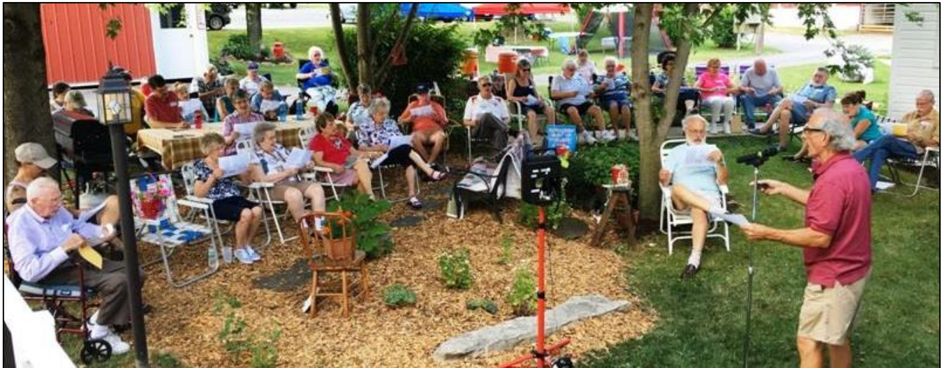
2016 Family Hymn Sing

Where: Lower Allen Community Park, Mechanicsburg