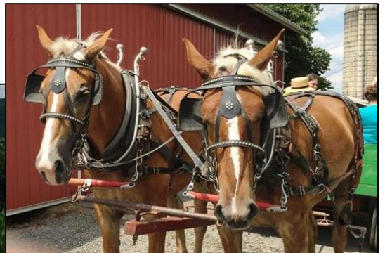
2016 Horse drawn Hayride