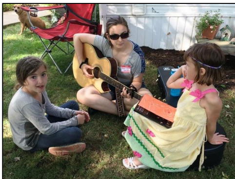
2016 Kids Worship